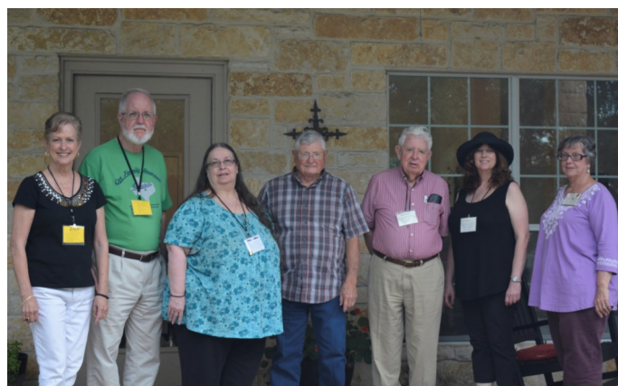
The 2023 Brandywine Officers in attendance at the Lampasas reunion.